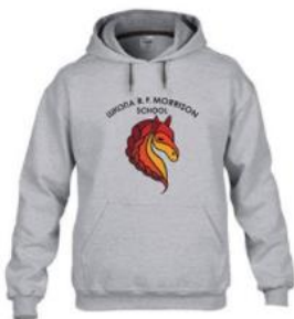
RFM ADULT PULLOVER HOODIE