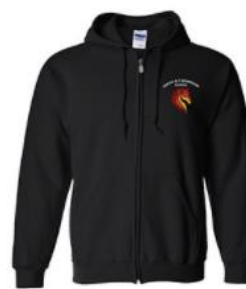
RFM ADULT FULL ZIP HOODIE