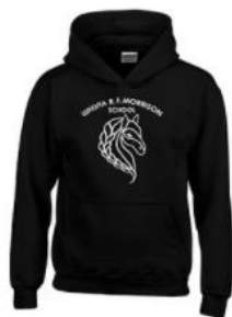
RFM YOUTH PULLOVER HOODIE