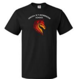
RFM SHORT SLEEVE TEE